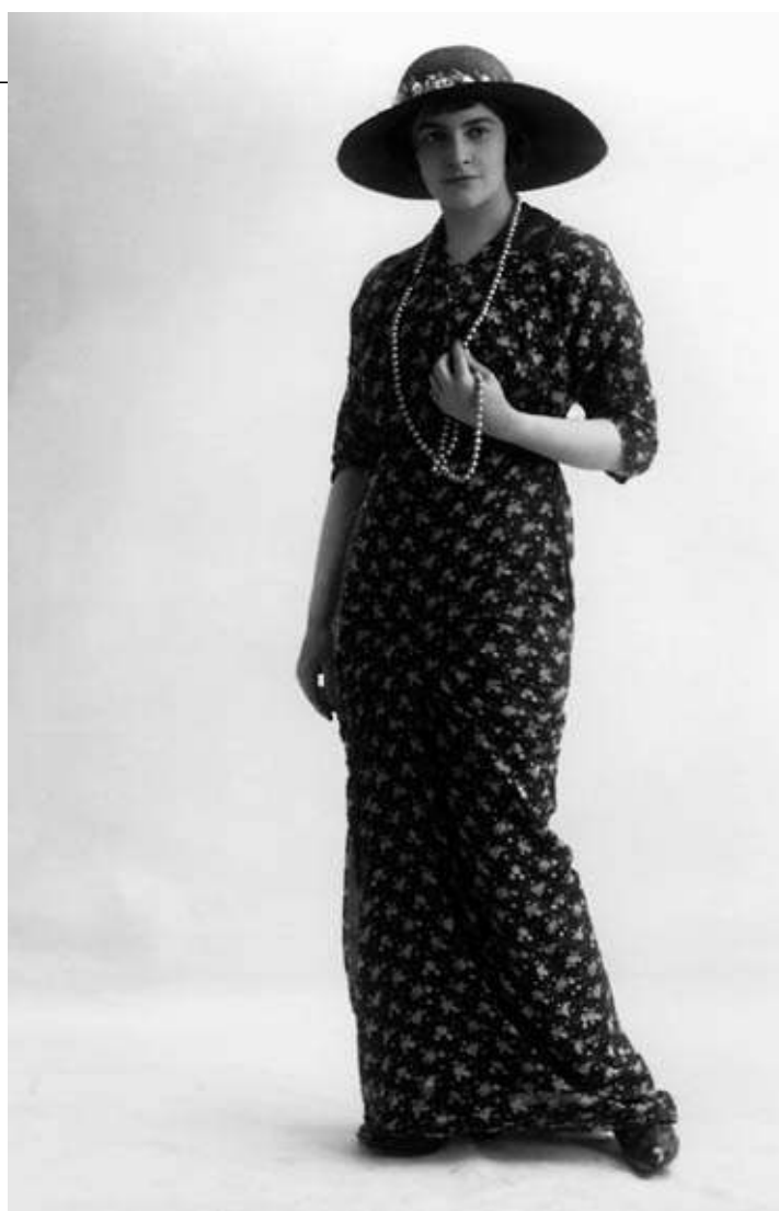
Cathleen Nesbitt, 1913.