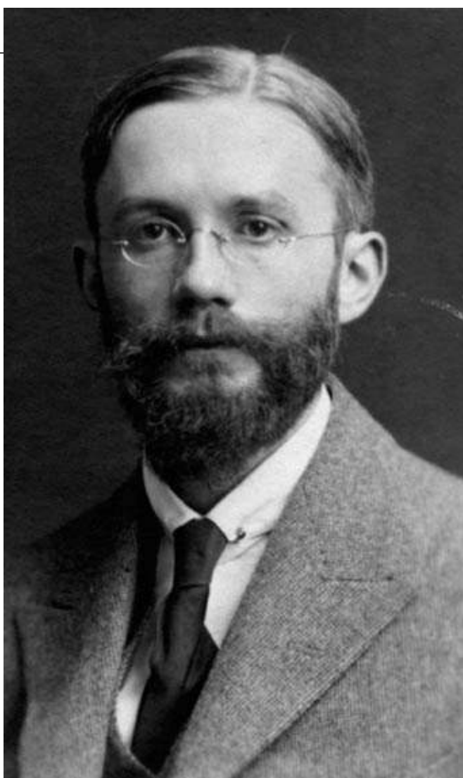
James Strachey, becoming a Freudian, around 1918.