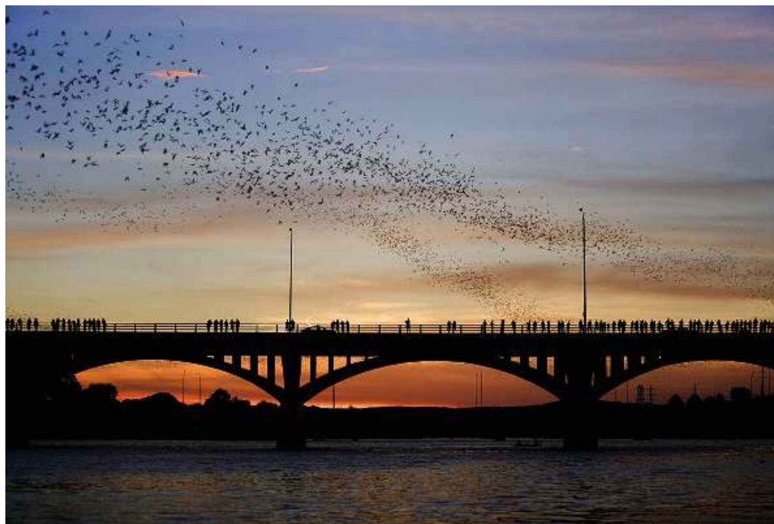
Bats over Ann W. Richards Congress Avenue Bridge, Austin.

High Island, Bolivar Peninsula. Texas Audubon operates four bird sanctuaries on High Island, an oak-dense upland used by neotropical migrant birds during their spring migrations. For more information, click here .