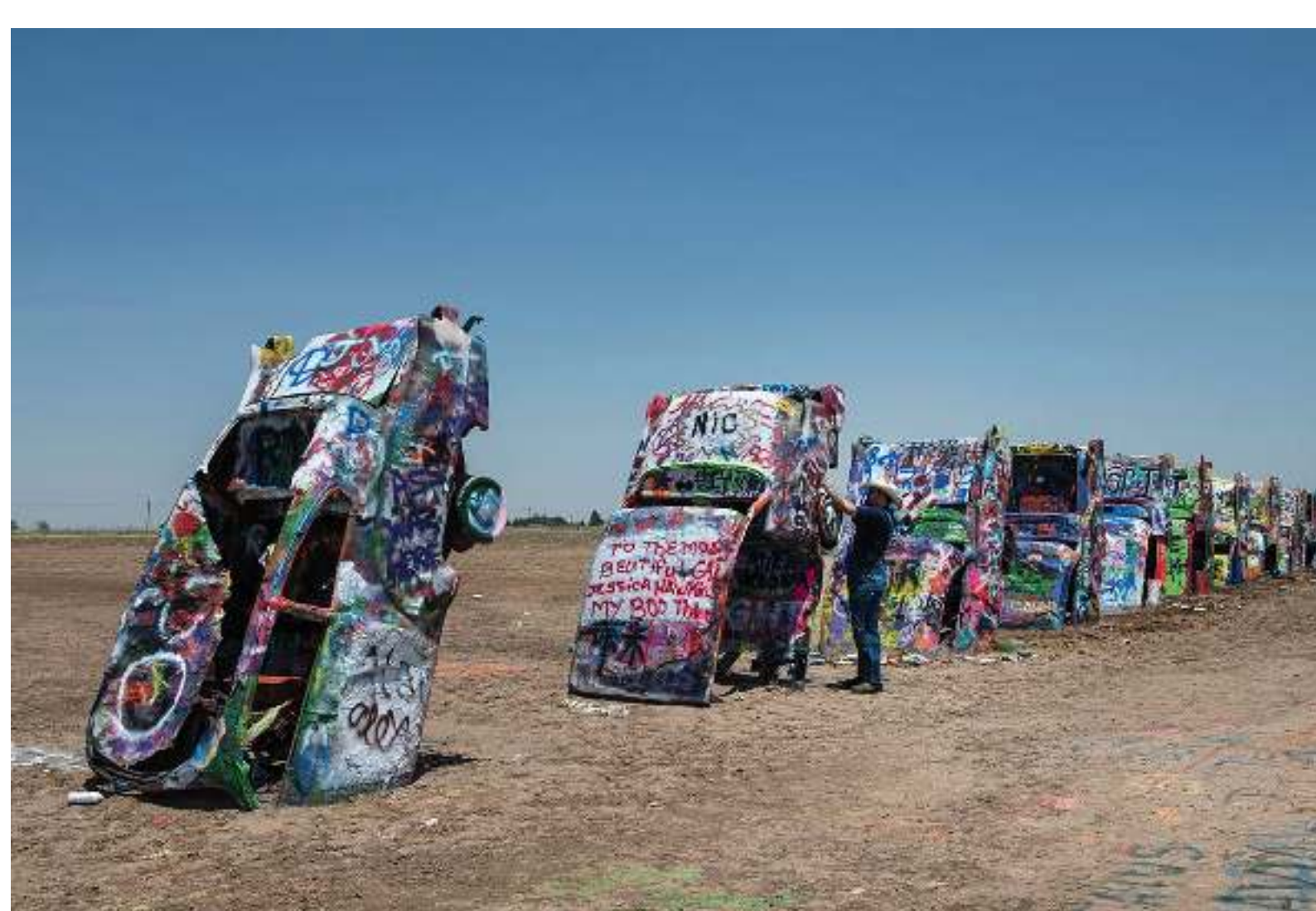
Cadillac Ranch, Amarillo.