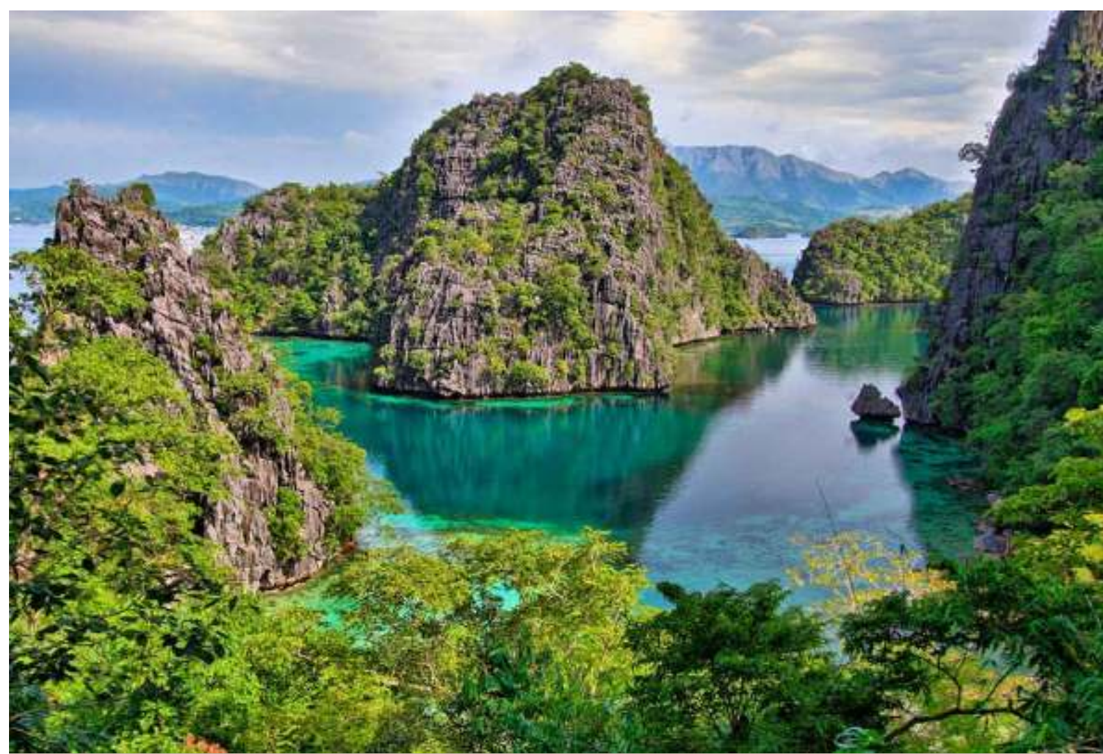
Blue Lagoon, Pagudpud

brewing). Two, stay flexible. Dispense with advance bookings so you can migrate to fairer climes if need be.