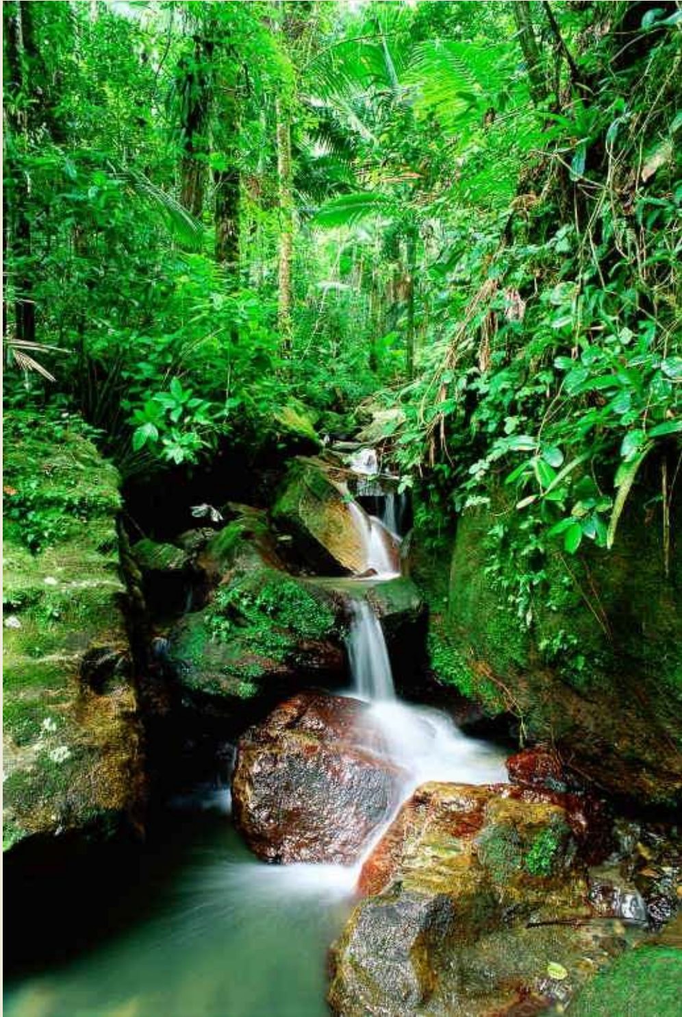
El Yunque National Forest