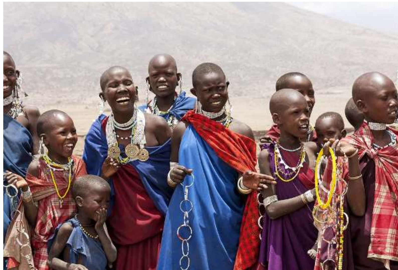
Maasai women

Wildlife galore, a snow-capped peak, fantastic beaches and Swahili ruins are but a backdrop to Tanzania's most fascinating resource – its people. Local culture is accessible and diverse: seek Cultural Tourism Programs to get acquainted with the Maasai, learn about the burial traditions of the Pare and experience a local market day with the Arusha. Hike past Sambiaa villages in the Usambaras and watch a Makonde woodcarver at work in Dar es Salaam. Wherever you go, Tanzania's rich cultures are fascinating to discover.