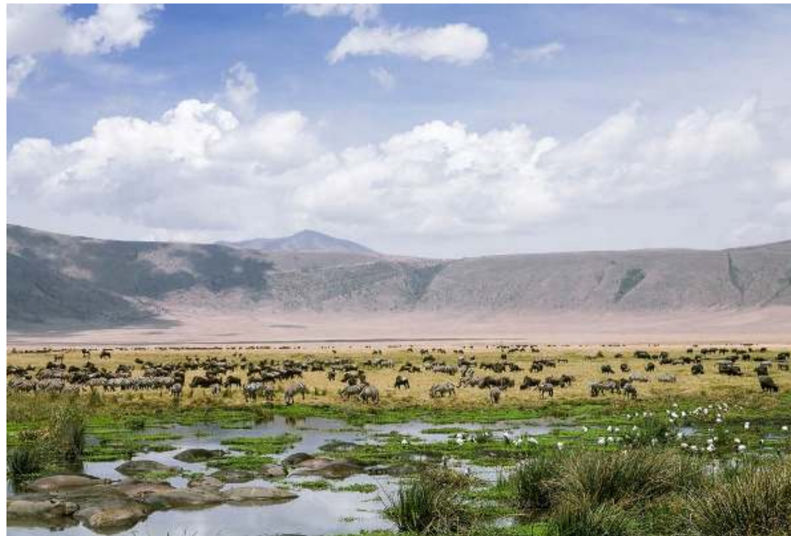
Ngorongoro Crater

On clear days, the magic of Ngorongoro starts while you're still up on the rim, with chilled air and sublime views over the enormous crater. The descent takes you down to a wide plain cloaked in hues of blue and green and covered in an unparalleled concentration of iconic African wildlife. If you're lucky enough to find a quiet spot, it's easy to imagine primeval Africa with an almost constant parade of animals streaming past against a quintessential East African backdrop. Go as early in the day as possible to maximise viewing time and to take advantage of the morning light.