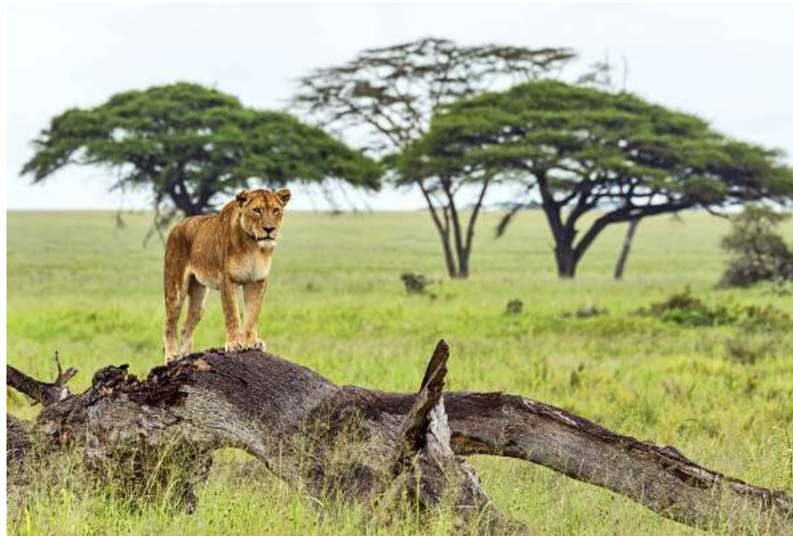
Lioness, Serengeti National Park

The sound of pounding hooves on the Serengeti plains draws closer. Suddenly, thousands of animals stampede by in a cloud of dust as the great wildebeest migration – one of earth's most spectacular natural dramas – plays out. Despite the theatrics, time seems to stand still in this superlative park. Lions sit majestically on lofty outcrops, giraffes stride gracefully into the sunset, crocodiles bask on riverbanks. Wildlife watching is outstanding year round. Just allow time to appreciate all the Serengeti has to offer.