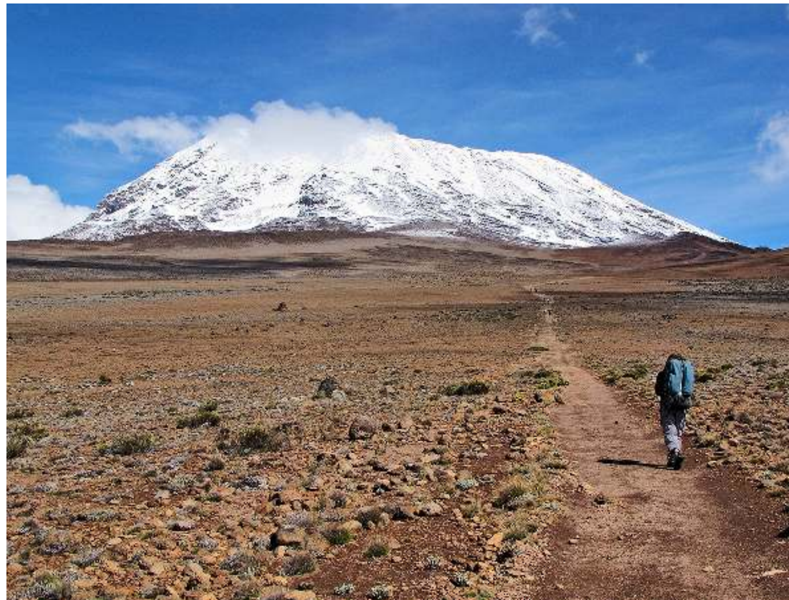
Mt Kilimanjaro

It's difficult to resist the allure of climbing Africa's highest peak, with its snow-capped summit and views over the surrounding plains. Thousands of trekkers complete the climb each year, with a main requirement for success being adequate time for acclimatisation. But there are also other rewarding ways to experience Kilimanjaro . Take a day hike on the mountain's lush lower slopes, learn about local Chagga culture or sip a sundowner from one of many nearby vantage points with the mountain as a backdrop.