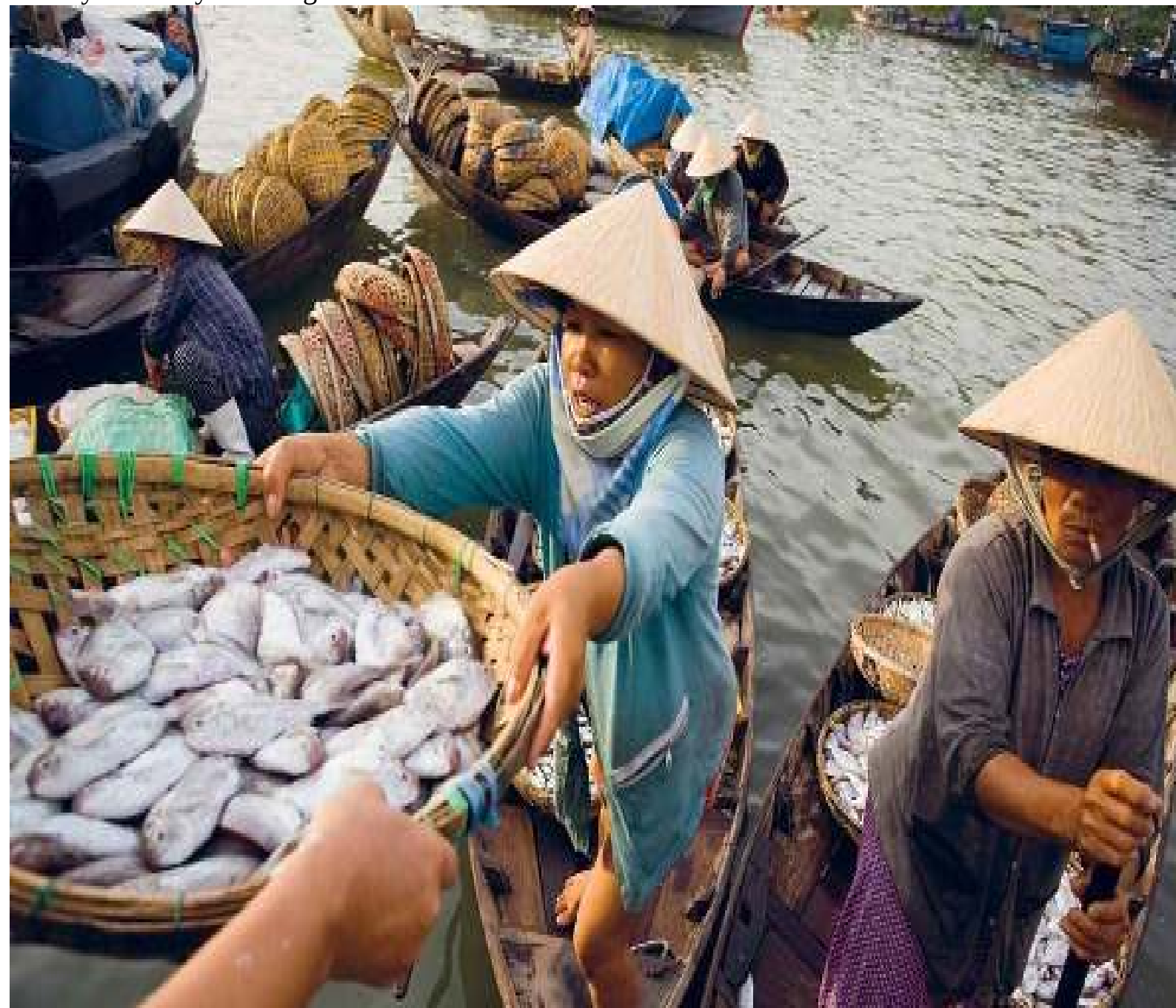
Delivering wares to Hoi An market

8 Antique Hoi An ( Click here ) was once Vietnam's most cosmopolitan port, as evidenced by the genteel shophouses that survive today. These have been repurposed into modern-day businesses: gourmet restaurants, hip bars and cafes, quirky boutiques and expert tailors. This is a sightseeing circuit offering historical wanderings through the warrens of the Old Town, religious exultation in grandiose pagodas, and markets and cooking courses to transform you into a knowledgeable chef. Wash off the hot day at nearby An Bang beach.