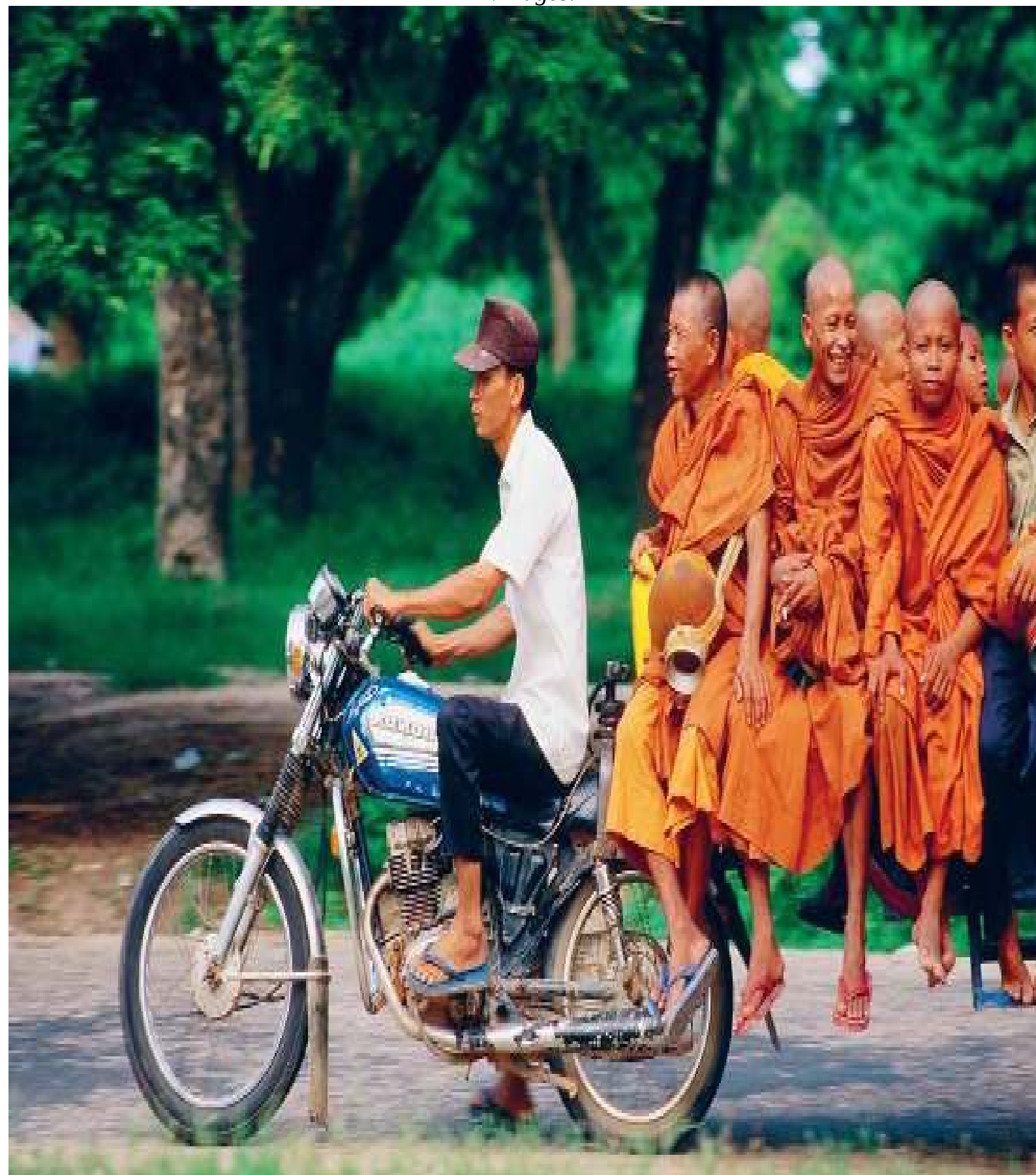
Buddhist monks travelling by motorcycle taxi, Siem Reap, Cambodia.

Exotic and tropical, friendly and hospitable, historic and devout, Southeast Asia offers a warm embrace, from its sun-kissed beaches and steamy jungles to its bustling modern cities and sleepy villages.