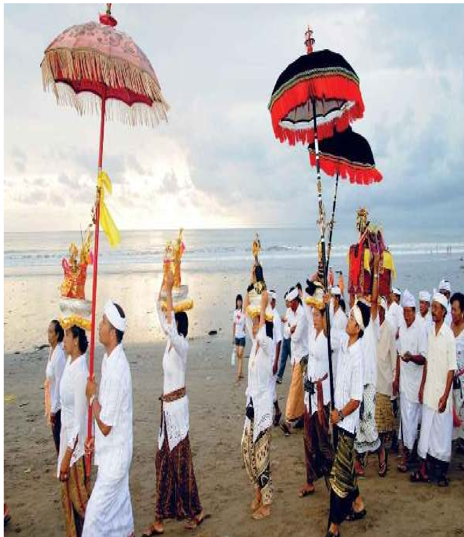
Hindu ceremony on Kuta beach.