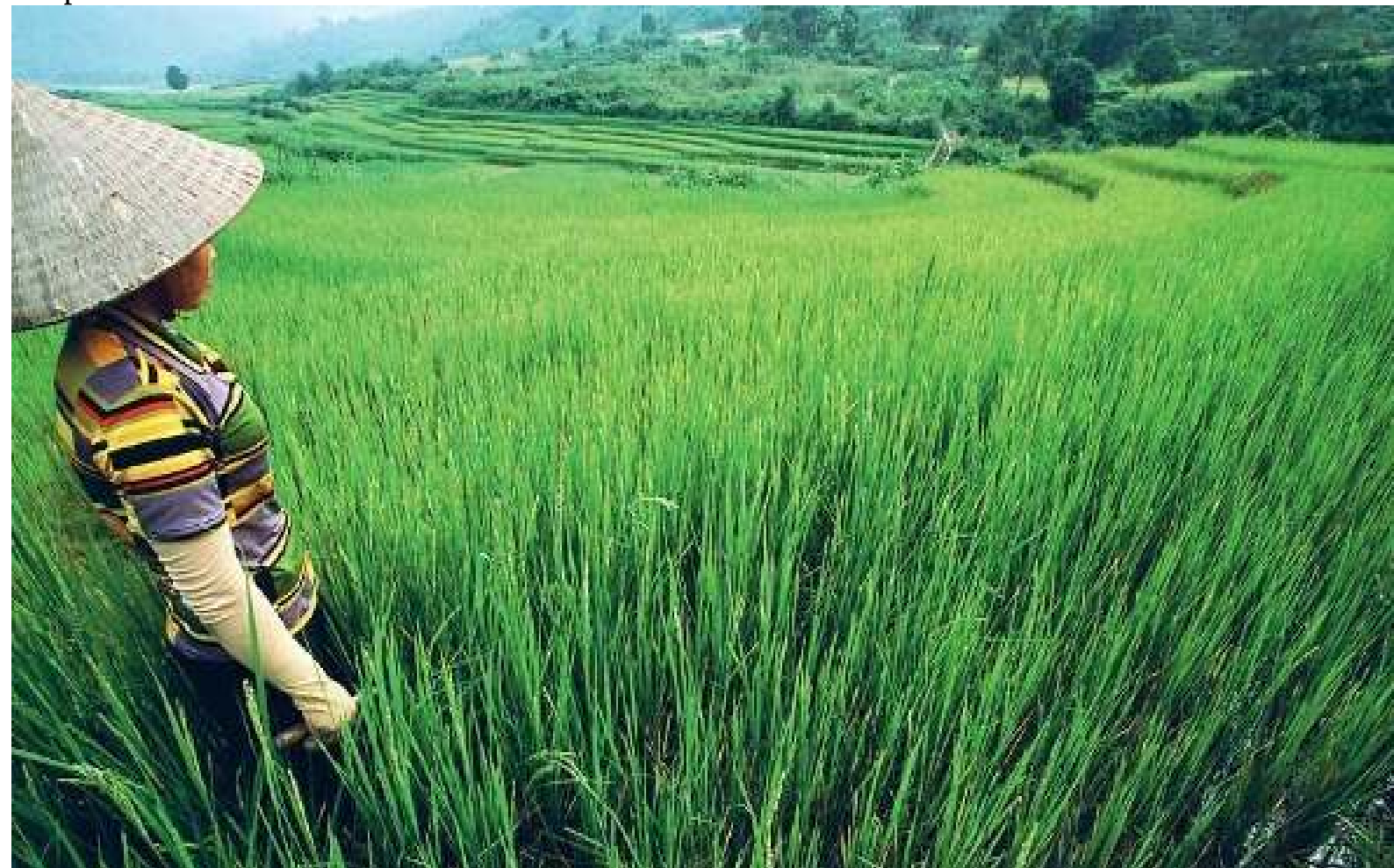
Rice paddies in northern Vietnam

Southeast Asia bathes in spirituality. With the dawn, pots of rice come to a boil and religious supplications waft from earth to sky. Barefoot monks silently move through dull-lit streets collecting food alms from the faithful; prayers bellow from needle-tipped mosques calling the devotees to bend to earth in submission; family altars are tended like thirsty houseplants. And the region’s great monuments have been built for the divine, from Angkor’s heaven incarnate to Bagan’s infinity-bending temple expanse. This is a region in close communication with the divine. Visitors can join in on the conversation on meditation retreats or by hiking into the mist belt to visit a golden-spired temple or sacred mountain.