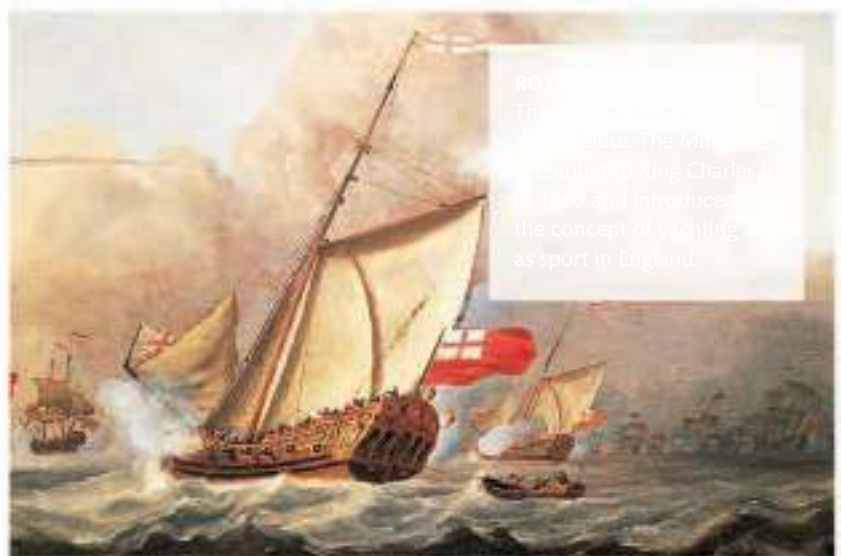
ROYAL YACHT The Royal Yacht Club of Great Britain was founded in 1792. The Marlborough was presented to King Charles II in 1660 and introduced the concept of yachting as sport in England.

The Royal Yacht Club of Great Britain was founded in 1792, and it is the oldest and largest sailing club in the world. The club's headquarters are located in Cowes, on the Isle of Wight, and it has a fleet of over 1,000 yachts. The club is responsible for the promotion and development of the sport of sailing in Great Britain, and it is proud to be the home of the sport. The club's members are from all over the world, and they enjoy the sport of sailing in a variety of ways. The club's events include regattas, races, and cruises, and it is a great place to meet and make friends. The club is also responsible for the maintenance of the Cowes Regatta, which is one of the largest and most famous sailing events in the world.