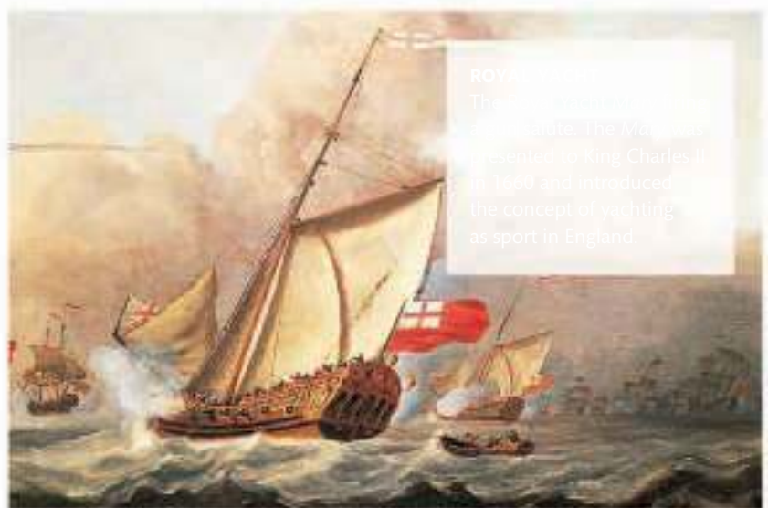
ROYAL YACHT The Royal Yacht Club of Great Britain was founded in 1792. The Mary II was presented to King Charles II in 1660 and introduced the concept of yachting as sport in England.

The modern sport of sailing is a combination of the traditional and the modern. It is a sport that has become increasingly popular in recent years, and it is a sport that has become a major part of the leisure industry. The Royal Yacht Club of Great Britain is the largest and most prestigious of the national yacht clubs, and it is the governing body for the sport in the United Kingdom. The club has a long and distinguished history, and it has played a major role in the development of the sport. The club is a member of the International Yacht Union, and it is a member of the International Olympic Committee. The club is also a member of the International Yacht Club Association, and it is a member of the International Yacht Club of America.