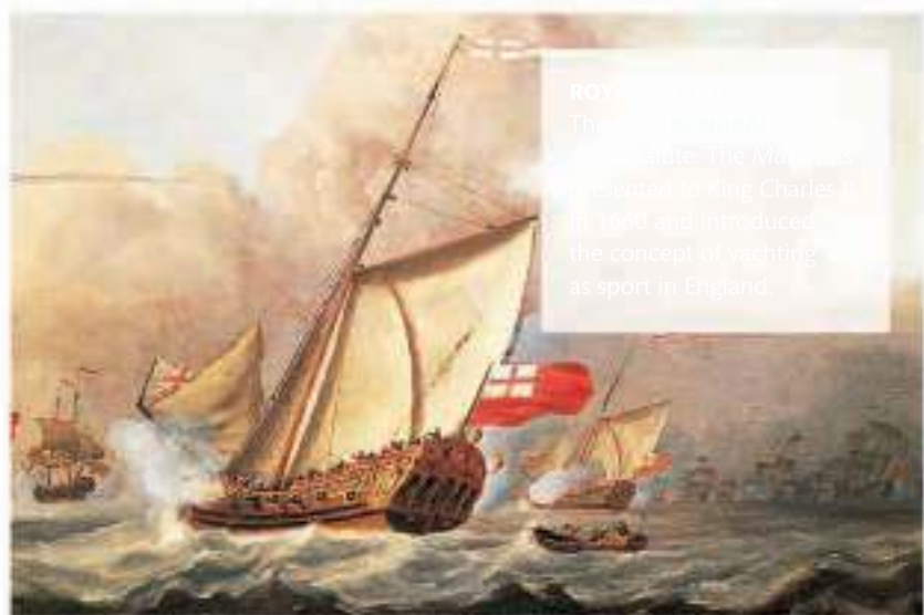
ROYAL YACHT The Royal Yacht Club of Great Britain was founded in 1792. The Mary II was presented to King Charles II in 1660 and introduced the concept of yachting as sport in England.

The Royal Yacht Club of Great Britain is the world's oldest and largest sailing club, and it is proud to be the home of the sport in this country. The club was founded in 1792, and it has since grown to become the largest sailing club in the world. The club is responsible for the promotion of the sport, and it organizes a variety of events, including regattas, races, and cruises. The club also provides a range of facilities for its members, including a clubhouse, a marina, and a fleet of yachts. The club is also involved in a number of charitable activities, and it has a long history of supporting the development of the sport in this country. The club is a member of the International Yacht Union, and it is also a member of the International Olympic Committee. The club is proud to be the home of the sport in this country, and it is committed to promoting the sport for the benefit of all.