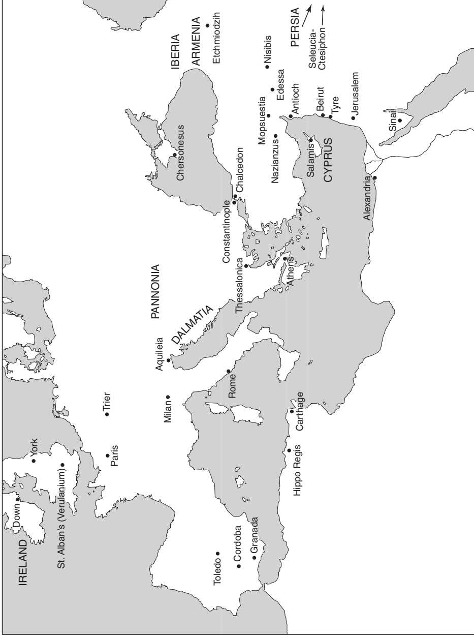
Map 1 The Early Christian world.