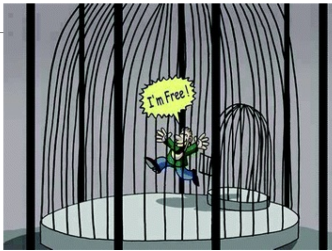
Fig. 1.2 A trivial cartoon that surfaced widely on the internet in 2013 depicting a person released from prison into terrestrial society. However, it very succinctly raises the central question which this book explores—will the apparent freedom of escaping the Earth merely leave humans at the mercy of other forms of entrapment or tyranny in the very societies they construct, regardless of the spatial scale of the interplanetary and interstellar environment?

It is evident that finding solutions to tyrannical extraterrestrial leadership depends much on the character of constituted authority and the form of government. Ian Crawford explores the nature of federalism beyond Earth and its suitability as a means to realising collectivist needs, while maintaining the maximum amount of freedom. He shows that by drawing on the lessons learned on Earth, there is much that can be done in advance to shape a future in space where liberty is maximised.