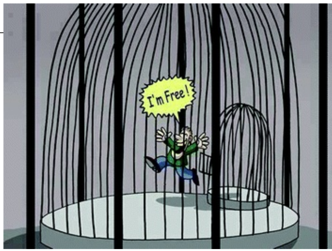
Fig. 1.2 A trivial cartoon that surfaced widely on the internet in 2013 depicting a person released from prison into terrestrial society. However, it very succinctly raises the central question which this book explores—will the apparent freedom of escaping the Earth merely leave humans at the mercy of other forms of entrapment or tyranny in the very societies they construct, regardless of the spatial scale of the interplanetary and interstellar environment?

It is evident that finding solutions to tyrannical extraterrestrial leadership depends much on the character of constituted authority and the form of government. Ian Crawford explores the nature of federalism beyond Earth and its suitability as a means to realising collectivist needs, while maintaining the maximum amount of freedom. He shows that by drawing on the lessons learned on Earth, there is much that can be done in advance to shape a future in space where liberty is maximised.